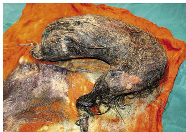
Fig. 2. Trichobezoar in the shape of stomach removed at surgery

ing, persistent weight loss and anaemia. Also, we must keep in mind the possibility of foreign bodies if there is unusual presentation of gastrointestinal problems. Diagnosis and treatment should include endoscopy with computed tomography and surgical management in most cases.